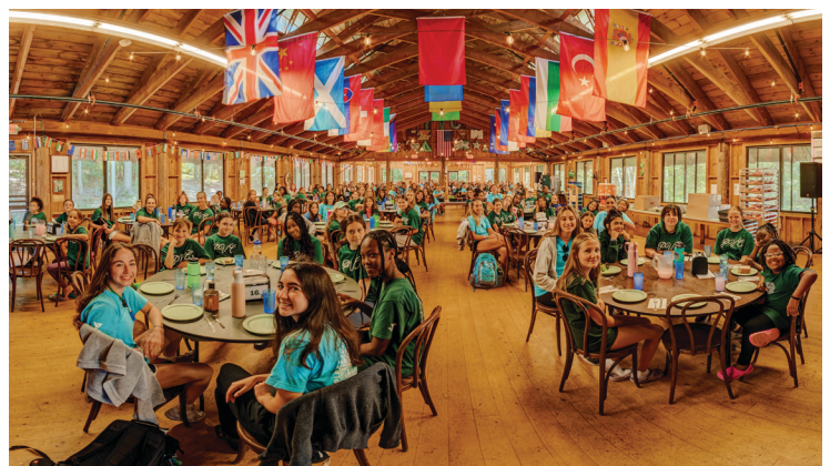
Happy to all be together again!