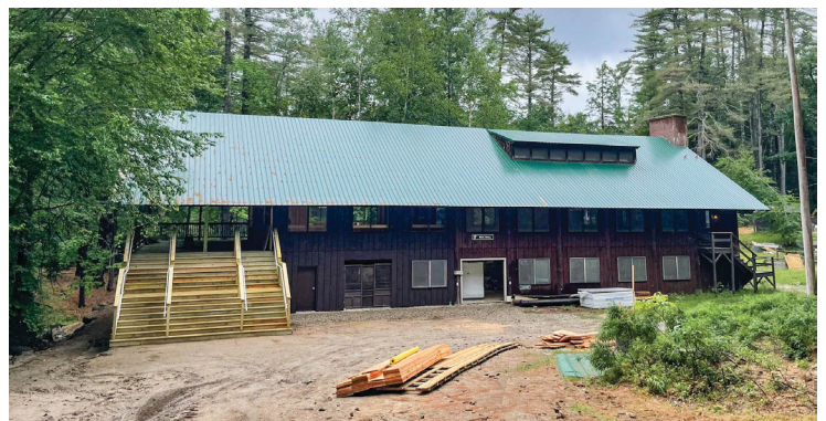
The new expanded Mac Hall!