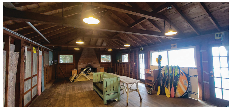
Updated electrical in Shang-Ri-La

of Arts and Crafts, demo begins early April and have completed our rewiring of Shang-Ri-La, with new interior and exterior lights, upgrades to our outlets and motion sensors for less waste of electricity. As the seasons turn our winter work on Sandy has ended as we wait for the lake to open back up, and before we know it, it'll be time to open camp for Summer 2025. We are looking forward to warm weather and Memorial Day as this camp season approaches.