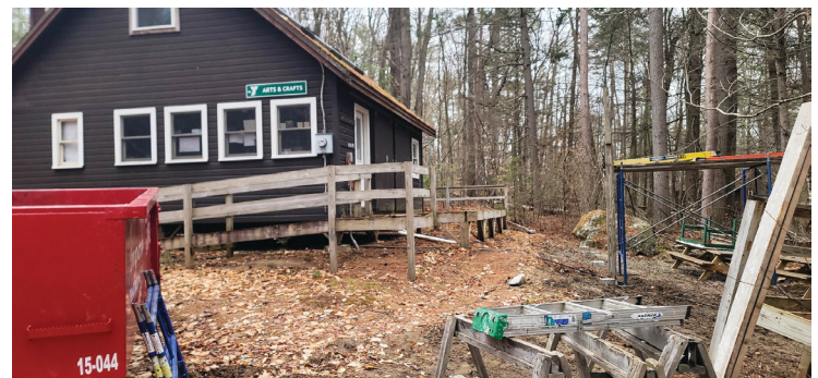
Beginning stages of Arts + Crafts porch expansion!