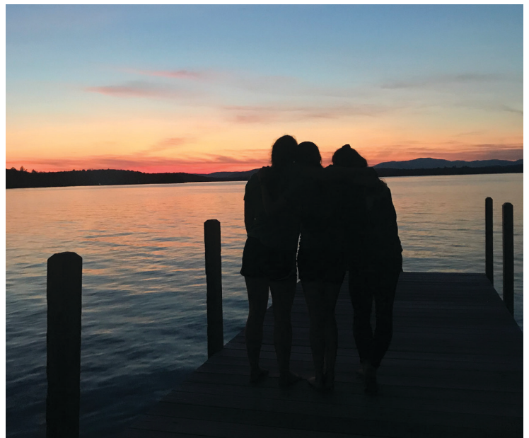
Cutie sunset friendship photo for ya because I had an awkward space to fill !