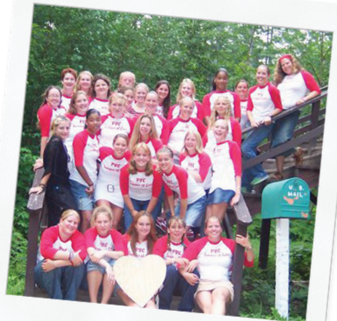
An ode to the original mailbox