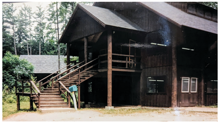
Mac Hall pre-expansion