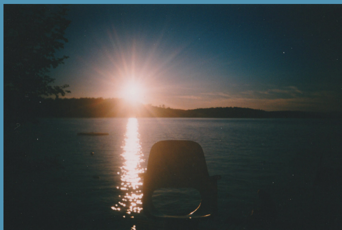
Pleasant Valley Waterfront 2004, Film developed at the Wolfeboro Rite Aid

Have old camp photos? Send them to us!! Please, we'd love to see them and share them with others!