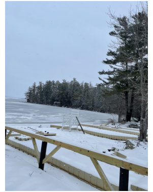
New Waterfront Railings