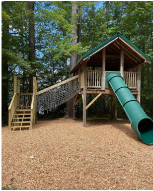
Renovation of the Sky House