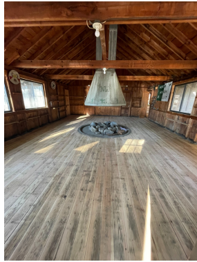
Jr House Improvements