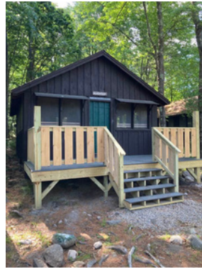
Jr Section Porches